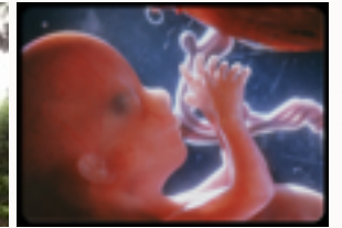
My soul is formed in the womb of the Universe ...