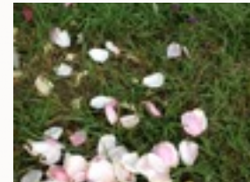
The Soul of the World is creation and her cycles ...