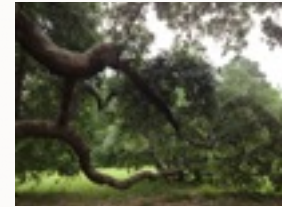
My soul is ancient and deeply rooted ...