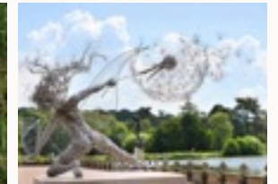
I am a Work of Art and I am The Artist at play!